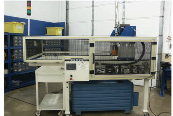
Pick & Go #101