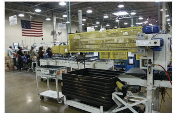
Pick and Go Unit 102 Topcraftpickerbrochure09.doc