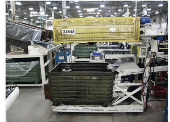
Pick and Go Unit 102