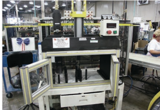
Push Out Machine

CAD Design & Engineering Complete Machine Shop Service Detail & Prototype Machining CNC Machining, Lathe & Mill Vertical Mills Material Handling Boring Mills Tooling Fixture Automated Systems Emergency Service Precision I.D., O.D. & Surface Grinding Honing Complete Welding & Fabrication TIG & MIG Welding Design & Build Special Machines Pick & Go Systems Rework & Production Runs Testing Fixture