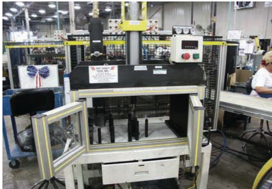
Push Out Machine

CAD Design & Engineering Complete Machine Shop Service Detail & Prototype Machining CNC Machining, Lathe & Mill Vertical Mills Material Handling Boring Mills Tooling Fixture Automated Systems Emergency Service Precision I.D., O.D. & Surface Grinding Honing Complete Welding & Fabrication TIG & MIG Welding Design & Build Special Machines Pick & Go Systems Rework & Production Runs Testing Fixture