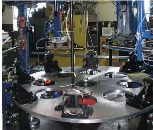
8 Stations Dial Assemble Machine with Vision Inspection Cameras