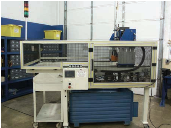
Pick & Go #101

Runs 24 hrs a day, 365 days a year Demo's available upon your request!