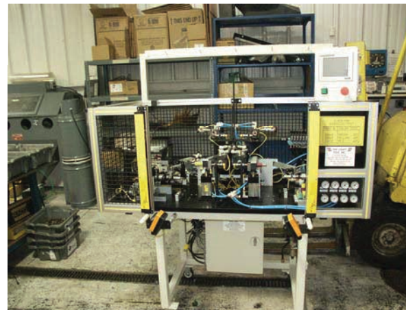
Production Recliner Function Computer Controlled Cycle Test Machine