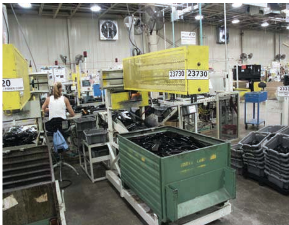
Pick & Go #100 – supplying operator